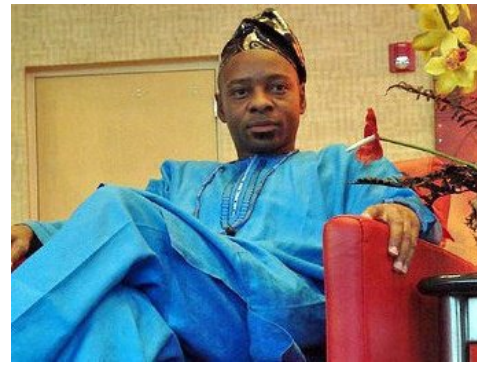
Live the Medicine

Ultimately, to Live the Medicine means participating in a system of strategies that are interwoven to create a personalized Òrìsà Lifestyle for yourself. Imagine what your life would be like if all of your natural gifts and talents actually supported one other and consistently supported your life's mission. It would be an amazing experience! Live the Medicine!